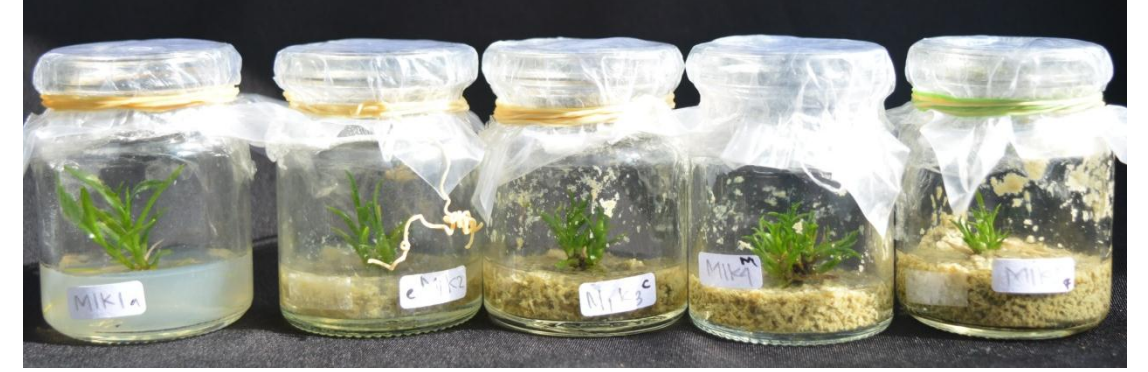
Figure 1. Live explant of Dendrobium nobile at 12 wap

According to Rifai et al., (2020) the growth and development of explants is influenced by the media used. The addition of growth regulators and the selection of quality explants affect the high ability of plantlets to survive (Ferita et al. , 2003 in Nurjaman & Isnawan, (2020). Explants grown on media supplemented with organic growth regulators such as Moringa leaves were also capable and suitable for the growth of Dendrobium nobile .