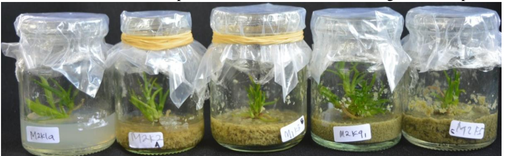
Number of plantlets on media 1/2 MS at the age of 12 wap